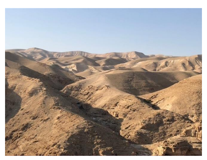
The Judean desert

The road and the concept of a journey is a theme which reaches back into the Old Testament; it provides a template for Jesus in his ministry and also perhaps for us as Christian pilgrims. Abraham sets out from Ur and then Haran to find the land promised to him by God (Genesis 11-13). Moses led the people out of slavery in Egypt, through the desert and eventually into the Promised Land led by Joshua (Joshua 1-3). The theme continues and perhaps most significantly, God opens up a road for the Jews to return from exile in