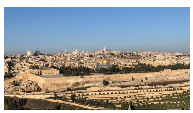
Overview of the Old City of Jerusalem