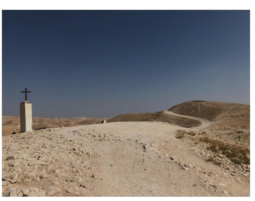
A road through the desert from Jerusalem to Jericho

Jesus's own journey recounted in the second half of Luke's Gospel, has been described by many commentators as 'The Road to Jerusalem'. It starts with Jesus setting his face in the direction of the Holy City and then in the ensuing ten chapters (Luke 9-19), Jesus makes geographically circuitous, but a theological straight line, to his confrontation the with powers and authorities of his time.