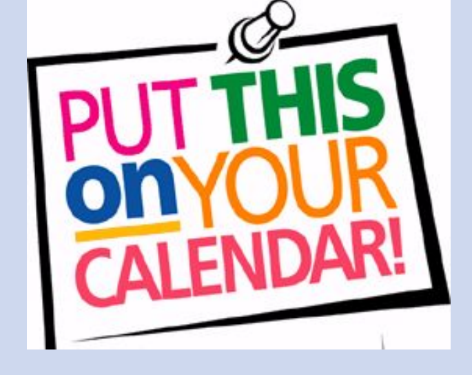
Senior Lunch with the Methodists

Madison United Methodist Church is hosting a community wide, senior brunch on November 7th from 10:30am to 1pm. The meal is free of charge. Come meet our neighbors, enjoying food, and fellowship together!