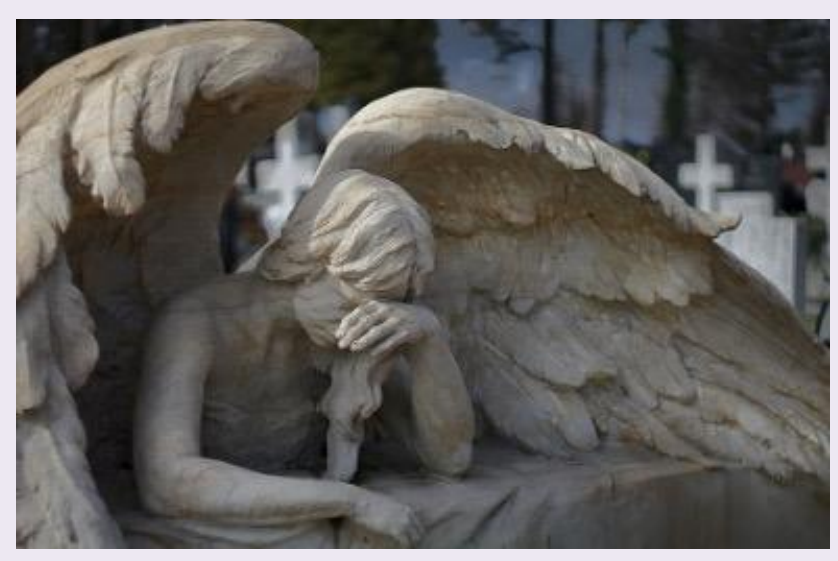
Grief Support Group